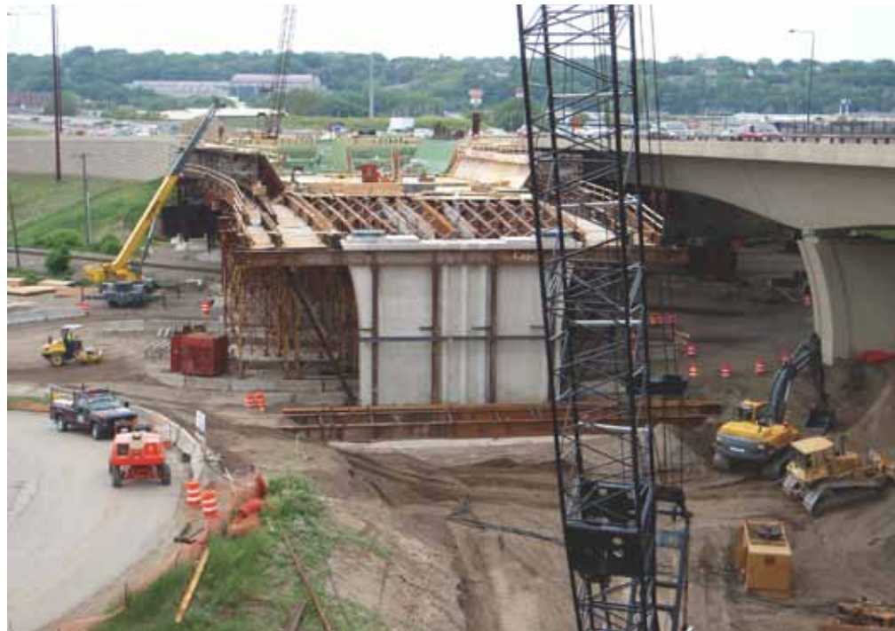
The westerly span of each structure was constructed on falsework over in-service railroad tracks.

Each cast-in-place segment was cast monolithically. A typical segment placement required approximately 125 yd 3 of concrete and took 4 hours using two concrete pumps. Prior to casting the midspan closures for Spans 3 and 4 (both 466 ft long), they were jacked apart with 400 tons of force to reduce the long-term stresses in the fixed piers.