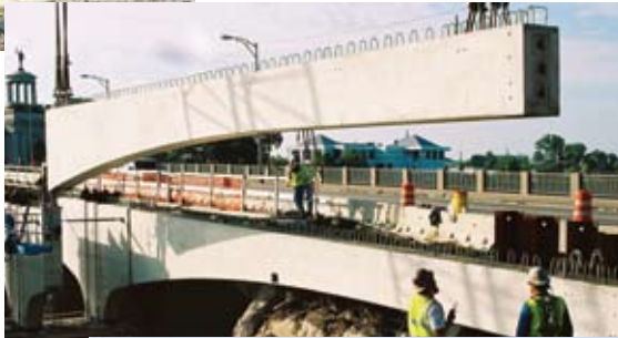
End span segments were then erected.