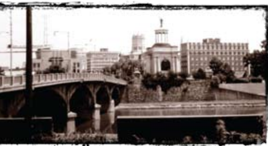
Original historic 1915 High-Main Street Bridge.