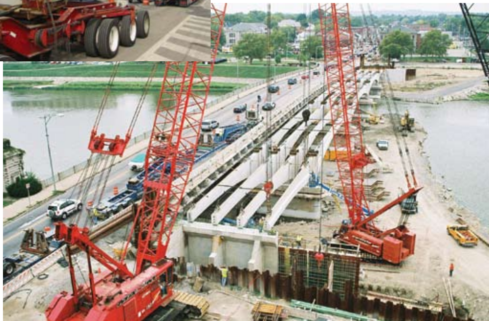
Completion of four lines of girders for Stage 1.

'The designers evaluated five systems before deciding on the precast concrete girder alternative.'