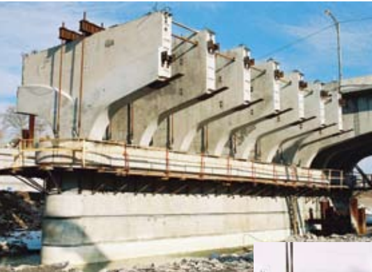
Pier segments were secured with temporary tie downs.