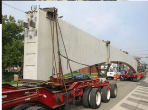
Next, interior spans were delivered for erection.

designed to range from about 3.5 ft deep at the apex of each span to about 15 ft deep at the piers.