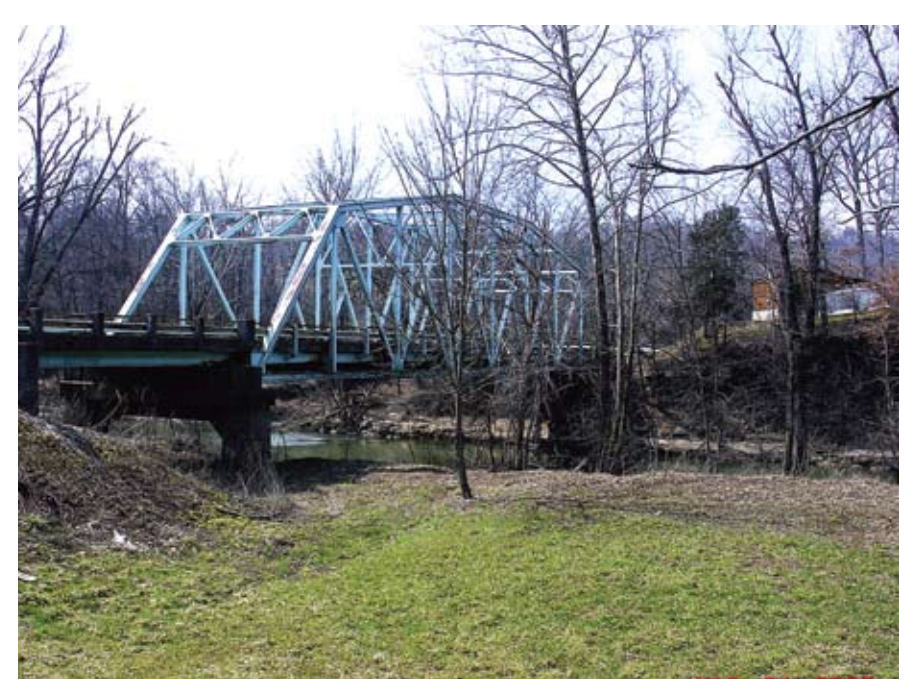
Old, deteriorated, steel-beam truss bridge over the Little Scioto River.

Design-build project delivery guarantees collaboration of the designer and contractor that will result in the most