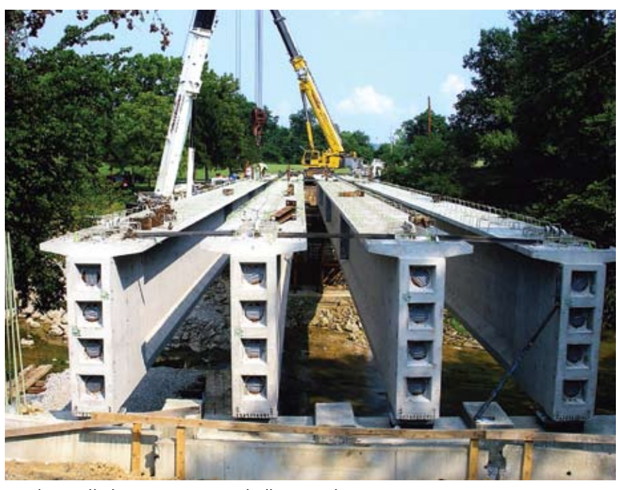
Newly installed, precast concrete bulb-tee girders.

The overall width of the bridge is 32 ft (9.8 m) out-to-out of the deck. This brings the total deck area to 201.5 \times 32 = 6448 ft<sup>2</sup> (600 m<sup>2</sup>). A plan, elevation, and cross section of the bridge are shown herein.