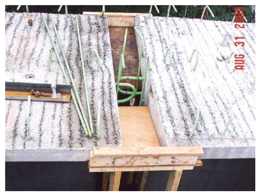
Adjoining precast concrete bulb-tee girder sections showing 1 ft (0.3 m) closure joint.

The successful bid used 8 ft 6 in.– deep (2.6 m), precast, prestressed concrete spliced bulb-tee girders with a 5 ft 1 in.–wide (1.6 m) top flange. Four girder lines at 8 ft (2.4 m) on center were used for a total of eight girders. Section lengths are 75 ft and 125 ft 6 in. (22.9 m and 38.3 m), with a 1-ft-wide (0.3 m) closure pour for a total span of 201 ft 6 in. (61.4 m). Two-stage posttensioning is used for the splicing.