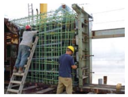
End girder detail prior to placing concrete in the girder.

of the poor past performance of weathering steel in the region and the county's desire to have a maintenance-free, long-life structure, steel was not chosen. These preliminary decisions presented some serious challenges to the designbuild teams but framed the project well.