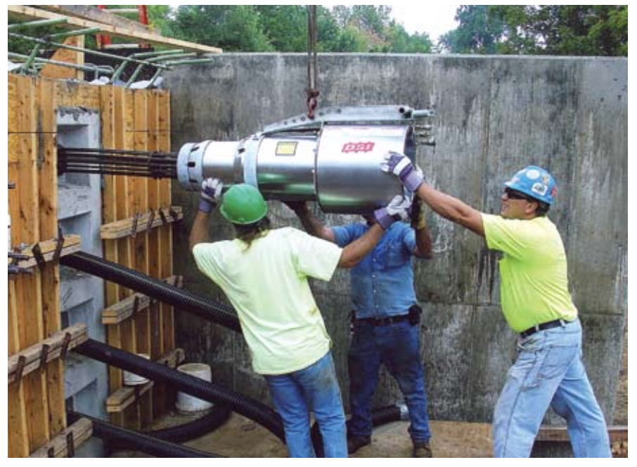
Post-tensioning the precast concrete bulb-tee girder at bridge end.