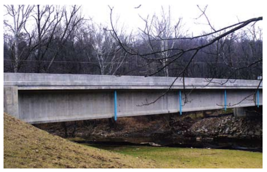
Side view of new Jeff Danzer Bridge over the Little Scioto River.

In this unique design-build project, spliced, precast concrete bulb-tee girders using semi-lightweight concrete and two-stage post-tensioning were designed to cross a river with a 200-ft-long (610 m) single-span structure.