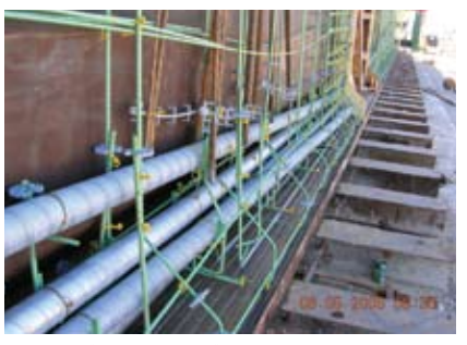
Swept ducts in girders prior to concrete placement.

Third, the bridge type was limited to galvanized steel, cast-in-place concrete, or precast/prestressed concrete. Because