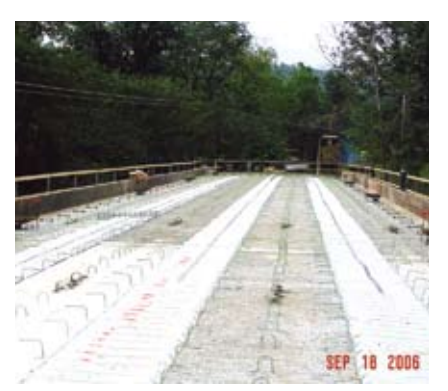
Bridge surface ready for 8½-in.-thick (216 mm) deck slab.

and stressing. Some concern over the depth of the concrete girders was one factor in the selection of a spliced, post-tensioned, four-girder line concept. The higher-cost steel alternate was 93 in. deep (2400 mm) and was also spliced but had only three girder lines.