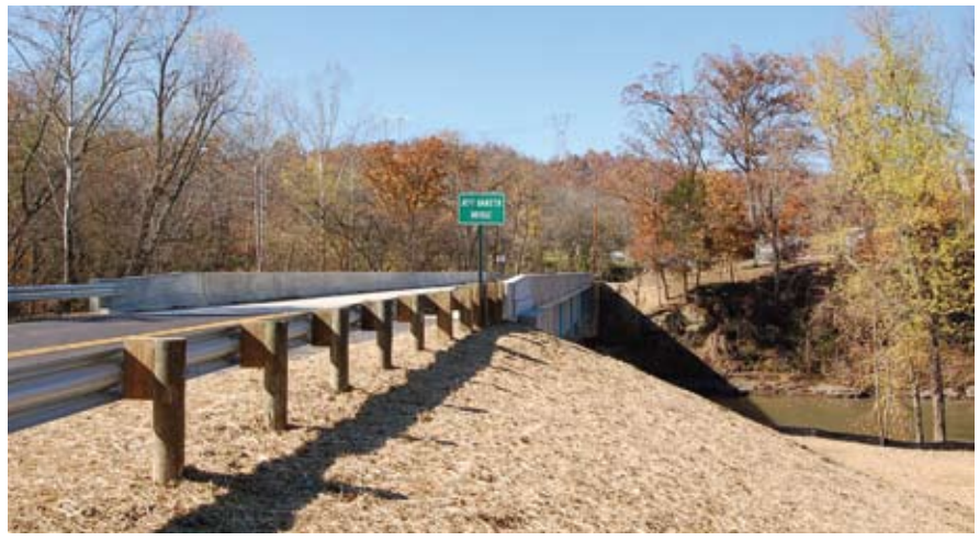
Top view of new Jeff Danzer Bridge over the Little Scioto River.