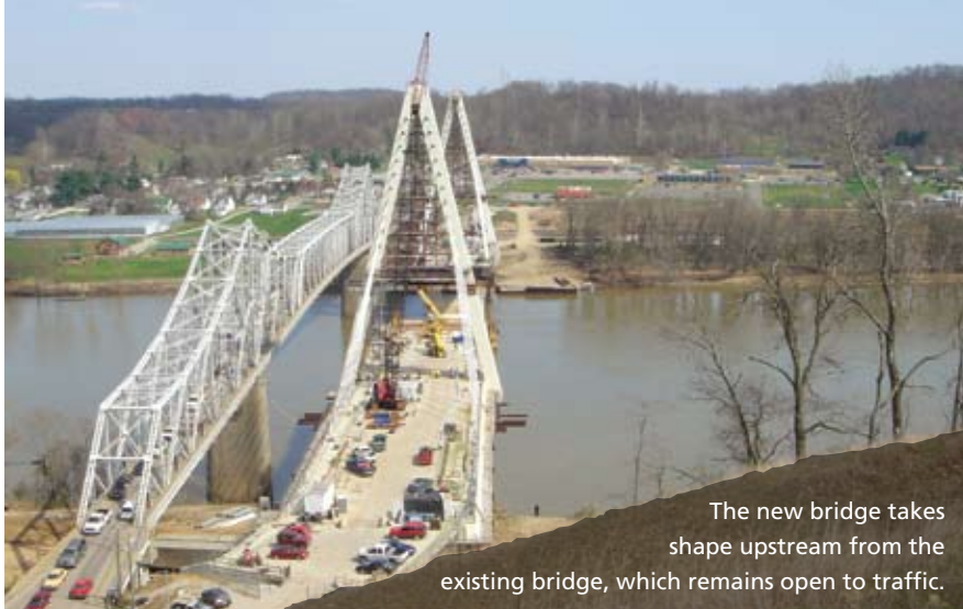
The new bridge takes shape upstream from the existing bridge, which remains open to traffic.

For more information on this or other projects, visit www.aspirebridge.org .