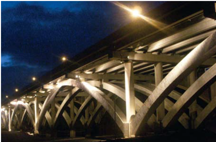
The new 1345-ft precast concrete arched bridge over the Fox River along I-88 in Illinois, designed to add lanes alongside an existing arched bridge, proved so successful that the project was extended to replace the original bridge, too.

As each arch half was delivered to the site, it was placed on temporary falsework, with one end supported on the substructure and the midspan end supported by a falsework tower. Cast-in-place closures at the arch crowns and thrust blocks were then added to establish continuity. The arch was released from its falsework support so it would begin to behave as an arch. After the arch deflected due to its self weight, it was shimmed tight to the falsework tower, near the center of the arch, to minimize the anticipated design moments during the stages of construction. This approach reduced the amount of structural reinforcing that was needed, saving money.