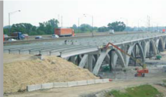
Precast concrete I-girders frame the approach spans and span between the spandrel bents. (top)

Designers ran two models, a two-dimensional analysis that took into account time-dependent properties of the concrete components, and a 3-D analysis to model the load distribution for the arches. These analyses ensured the construction team could sequence the construction process to optimize the arch design's inherent benefits during each stage by slightly manipulating the activities.