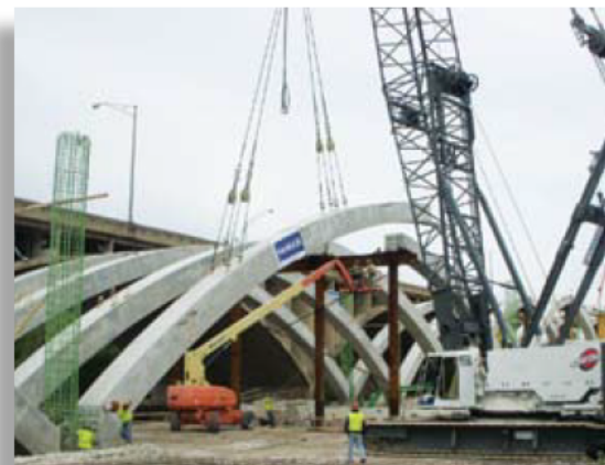
The concrete arches were fabricated in two pieces and supported on the substructure and falsework tower before closures were cast. (middle)