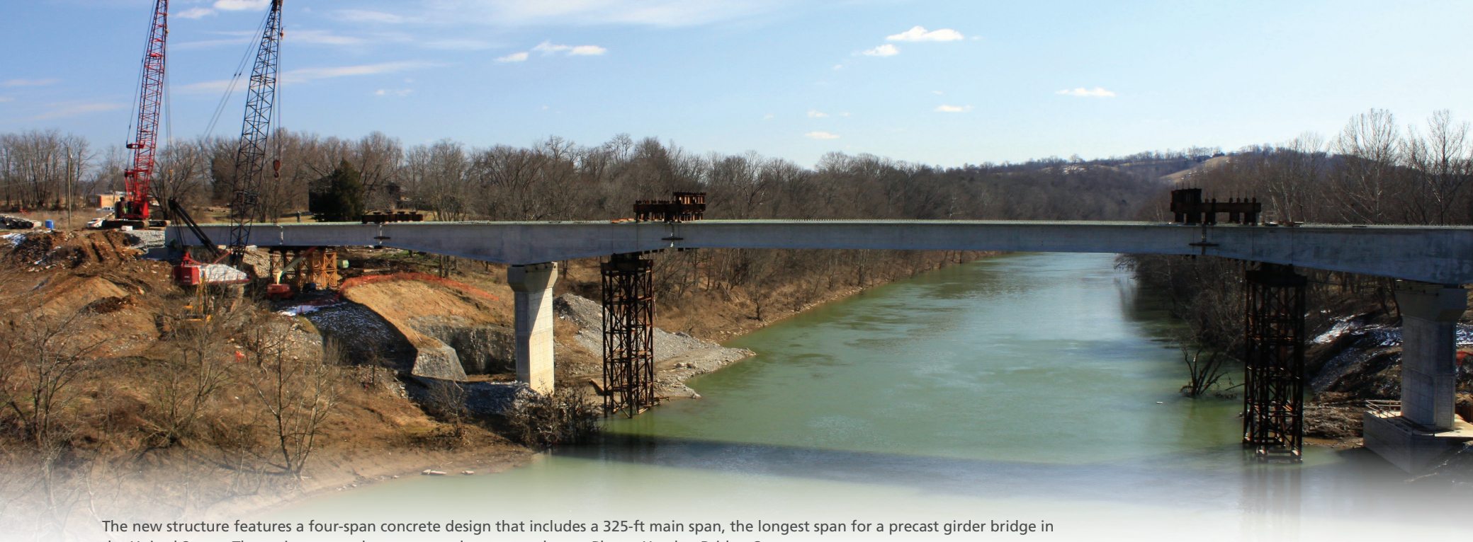
The new structure features a four-span concrete design that includes a 325-ft main span, the longest span for a precast girder bridge in the United States. The main span and east approach span are shown.