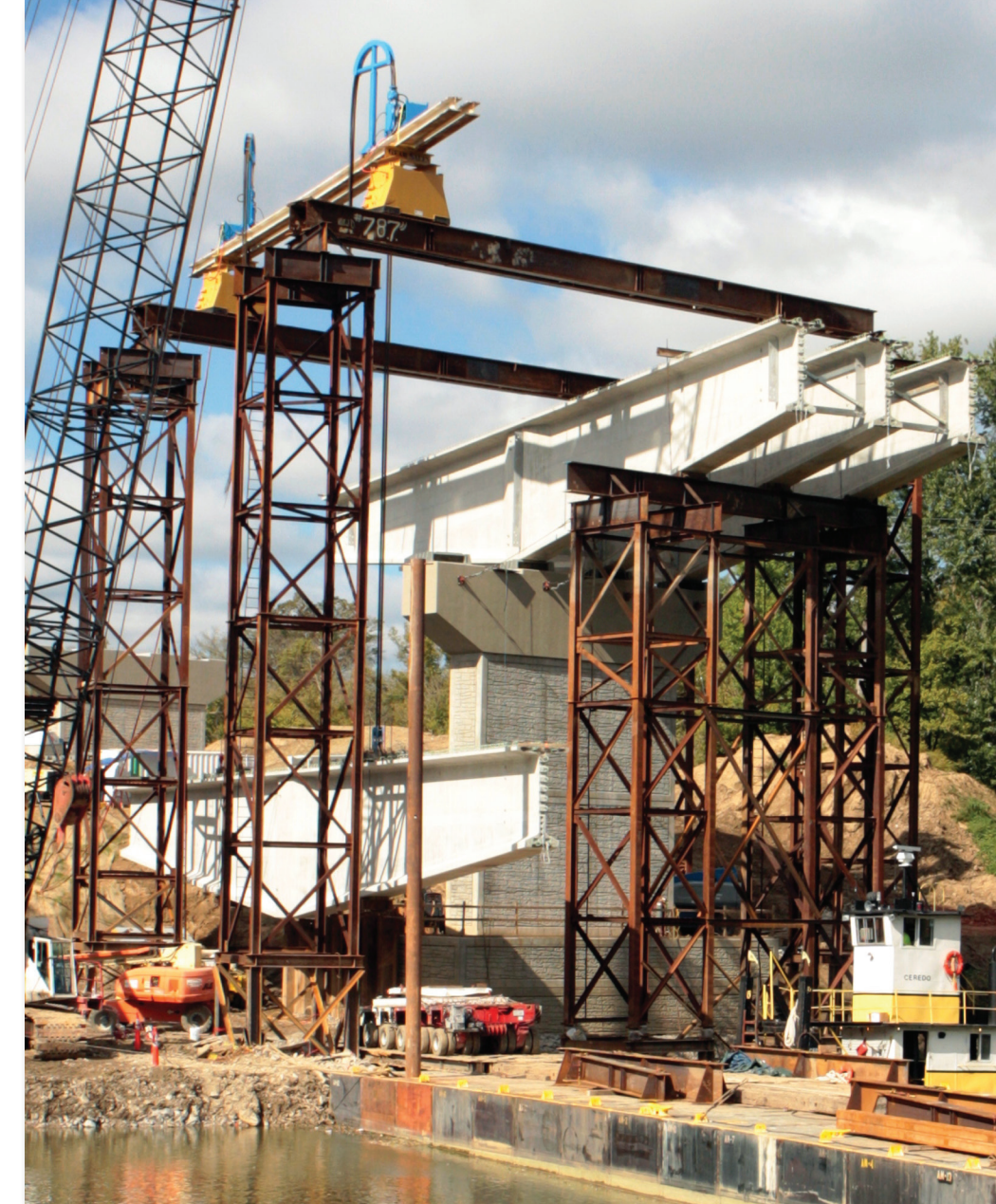
Temporary towers supported steel beams spanning over the piers that in turn supported a gantry with strand jacks to lift the pier segments and move them laterally into place. Photo: Haydon Bridge Co.

Pier segments were equipped with strongbacks at their main-span ends. The strand jacks were moved to the strongbacks to raise the drop-in girders into final position. Falsework towers under the pier segments provided temporary support of the cantilevers during this operation. Photo: Haydon Bridge Co.