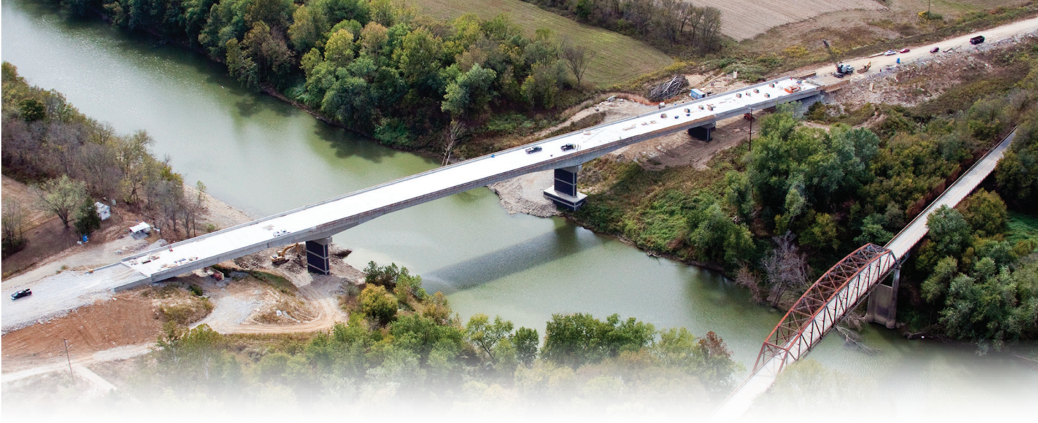
Left: The new spliced precast, prestressed concrete girder bridge along Route 22 over the Kentucky River replaces a deteriorated steel structure that will be demolished once construction is completed.

The bridge has four spans and four girder lines were used throughout the bridge. The center span features haunched bulb-tee pier segments varying from 9 ft deep to 16 ft deep. The haunched pier segments were each 138 ft long and weighed 169 tons. Between the two cantilevered pier segments, a 9-ft-deep drop-in girder, 185 ft long completed the 325-ft main span. Segments were joined with 1-ft-wide cast-in-place concrete closure joints.