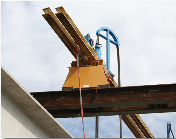
A strand jack was used to lift haunched pier segments from the barge to the pier seats. The jacks were later relocated and used to lift the drop-in girders for the main span.