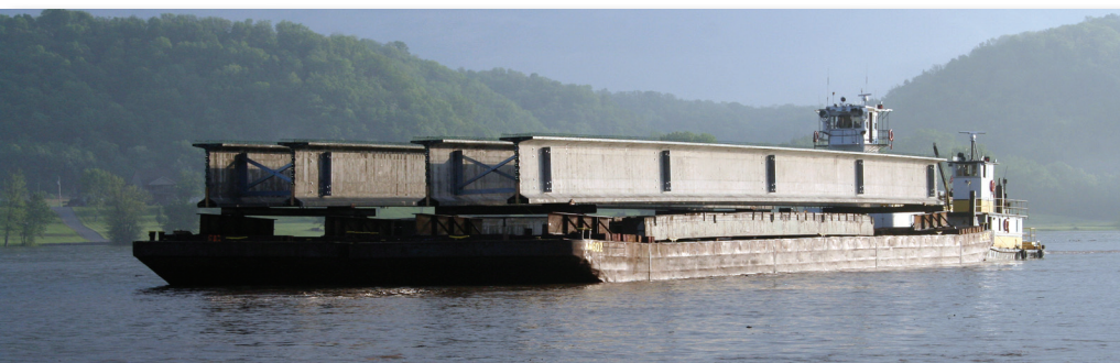
The girders were transported to the site on barges during high-water levels in the spring, after the precaster had modified and repaired several locks along the route.

Construction began with the end bents, piers, and temporary supports. Then the haunched pier segments were erected, followed by the main-span, drop-in segments. Once they were in place, the remaining girder segments were erected and the closures were cast.