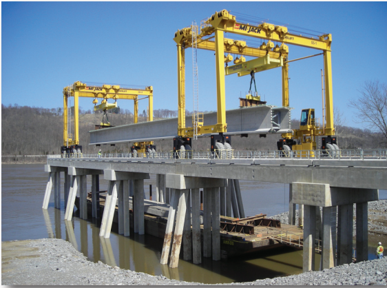
Above: The precaster’s loading pier allowed the heavy precast girders to be placed on specially designed barges, which delivered the components to the site. The 185-ft-long main-span, drop-in girders were always handled as braced pairs to address stability concerns.

Upon a closer examination of the locks, the precaster determined that the necessary repairs were not as extensive as originally expected. The repairs were made, and the barges were used to transport the girders. In the end, the river experienced flood-level conditions several times, requiring the contractor to adjust the work sequences and processes to maintain the project’s schedule.